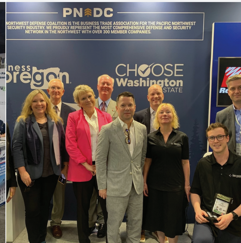
Eurosatory Delegation Paris, France