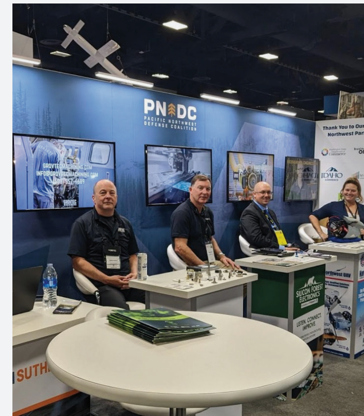
AUSA Shared Booth Washington, D.C.

We grew our presence nationally and internationally by offering members shared-booth space at three high profile events so they could extend their outreach and connections with military and security advisors from across the globe. Because these are turn-key exhibits, they give members a low-cost way to expand their reach globally.