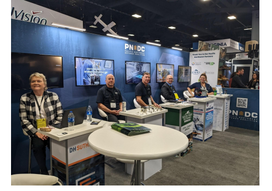
AUSA Annual Meeting October 9th - 11th, 2023 Last Spot Remaining!

Share a booth with PNDC at the Association of the United States Army's Annual Meeting and expand your outreach and connections with military and security advisors from across the globe. We have tripled our space since last year to have 600 sq. ft. Register today to guarantee yourself the last spot remaining.